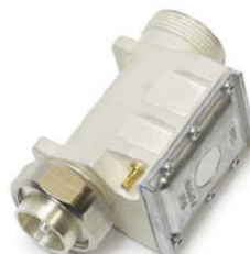
CIN - LGP213nn