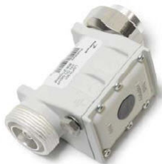
CIN - LGP233nn